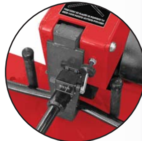
Hose Bending Pins