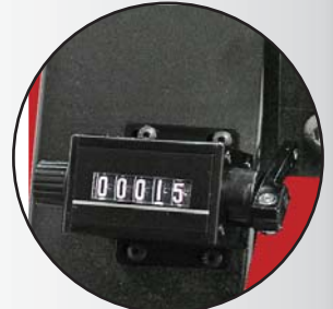
Hose Saw Counter