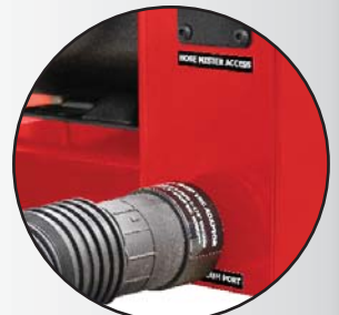
Available Vacuum Port