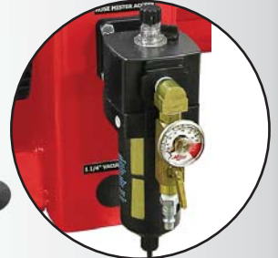
Mister Hose Assembly