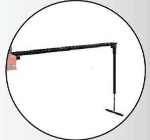
Hose Channel System