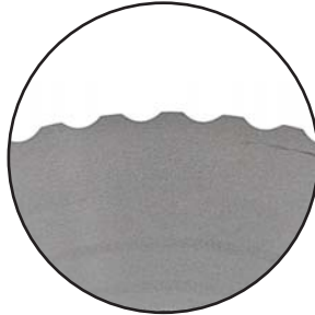
Scalloped Blade (General Purpose): Is recommended to cut multi-spiral hose.