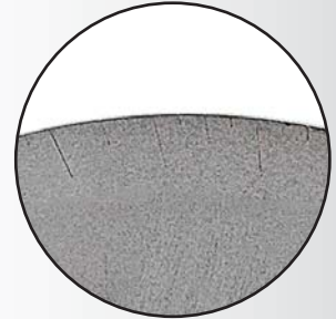
Double Bevel Blade with SS Slots: Is recommended for braided hose with minimum debris during the cut.