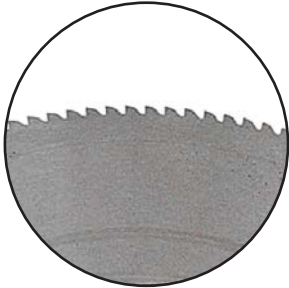
Serrated Blade (General Purpose): Is recommended to cut multi-spiral hose.

These rugged, HS-150 / HS-300 / HS-500 dependable saws offer features not found on other saws. Choose the one with the capacity and features which meet your individual requirements.